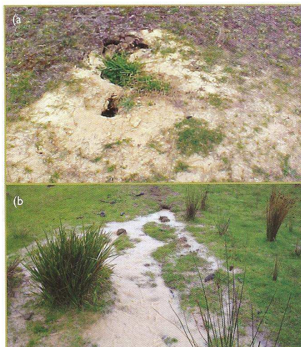
Figure 3. Sediment fans or 'spew holes' are often the first obvious sign of tunnel erosion