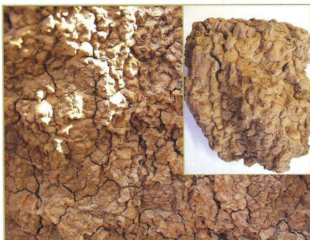
Figure 2 (a). Example of dribble pattern on an exposed subsoil, the photograph was taken from within an actively eroding tunnel system. (b) Dribble patterns on sodic soil ped.