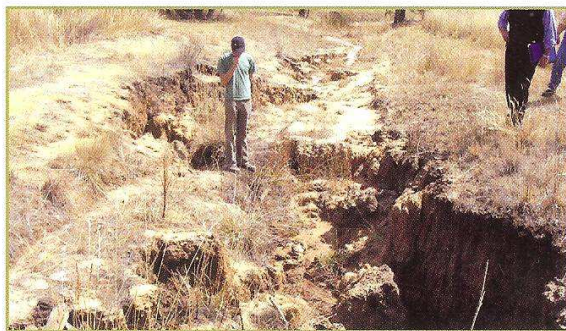
Figure 1. Tunnel and gully erosion resulting from construction of a stormwater culvert in dispersive clay.

In recent years, urban expansion has occurred in areas with dispersive soils. Disturbance of dispersive soils has resulted in tunnel erosion, damage to infrastructure, and environmental harm. Greater awareness of the difficulties posed by development on dispersive soils is required to prevent future damage. Tunnel erosion results in the formation of underground cavities that can collapse causing gully erosion and damage to infrastructure such as optical fibre cables, septic systems, roads, culverts and dwellings. Unlike other forms of erosion, tunnel erosion involves both chemical and physical processes associated with the dispersion of sodic clays. Given the difficulty of repairing tunnel erosion, management effort is focused on prevention of tunnel formation through increased understanding and awareness of the issues associated with construction and development on dispersive soils.