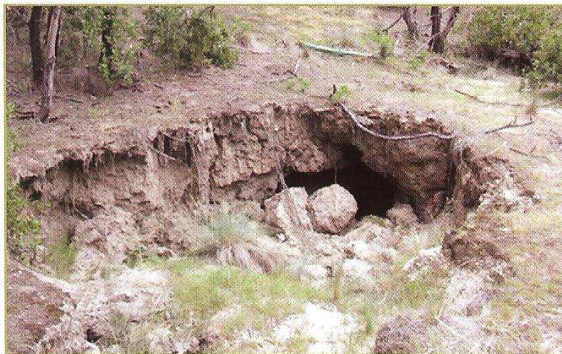
Figure 5. Piping failure or tunnel erosion in a dam constructed from soils derived from Permian mudstone. This dam is known to have failed on first filling. The image was taken from the dam floor.

Changes to hydrology, such as concentration of flow in culverts, runoff from hardened areas and ponding of rainfall may also increase the likelihood of tunnel erosion.